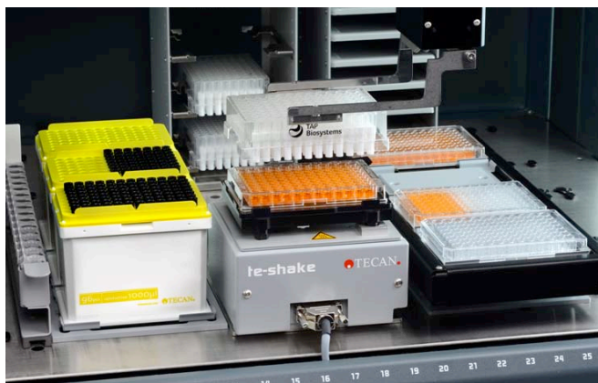
Figure 2 Freedom EVO equipped with carriers for automation of RAFT 3D cell culture. The RoMa Arm is holding a RAFT absorber plate, and a gel-filled cell culture plate is positioned on the Te-Shake. A cooled carrier containing cell culture plates is mounted to the right of the Te-Shake.

The RAFT process was automated on a Freedom EVO liquid handling workstation equipped with an eight-channel Liquid Handling (LiHa) Arm using disposable tips, a Robotic Manipulator (RoMa) Arm, a Te-Shake ® (heater-shaker), and cooled carriers (4 °C; active cooling of the reagents and the collagen solution is essential to control gel formation) for storage of reagents and microplates (Figure 2).