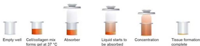
Figure 1 Schematic drawing of the RAFT 3D cell culture plating, gel induction and concentration procedures.